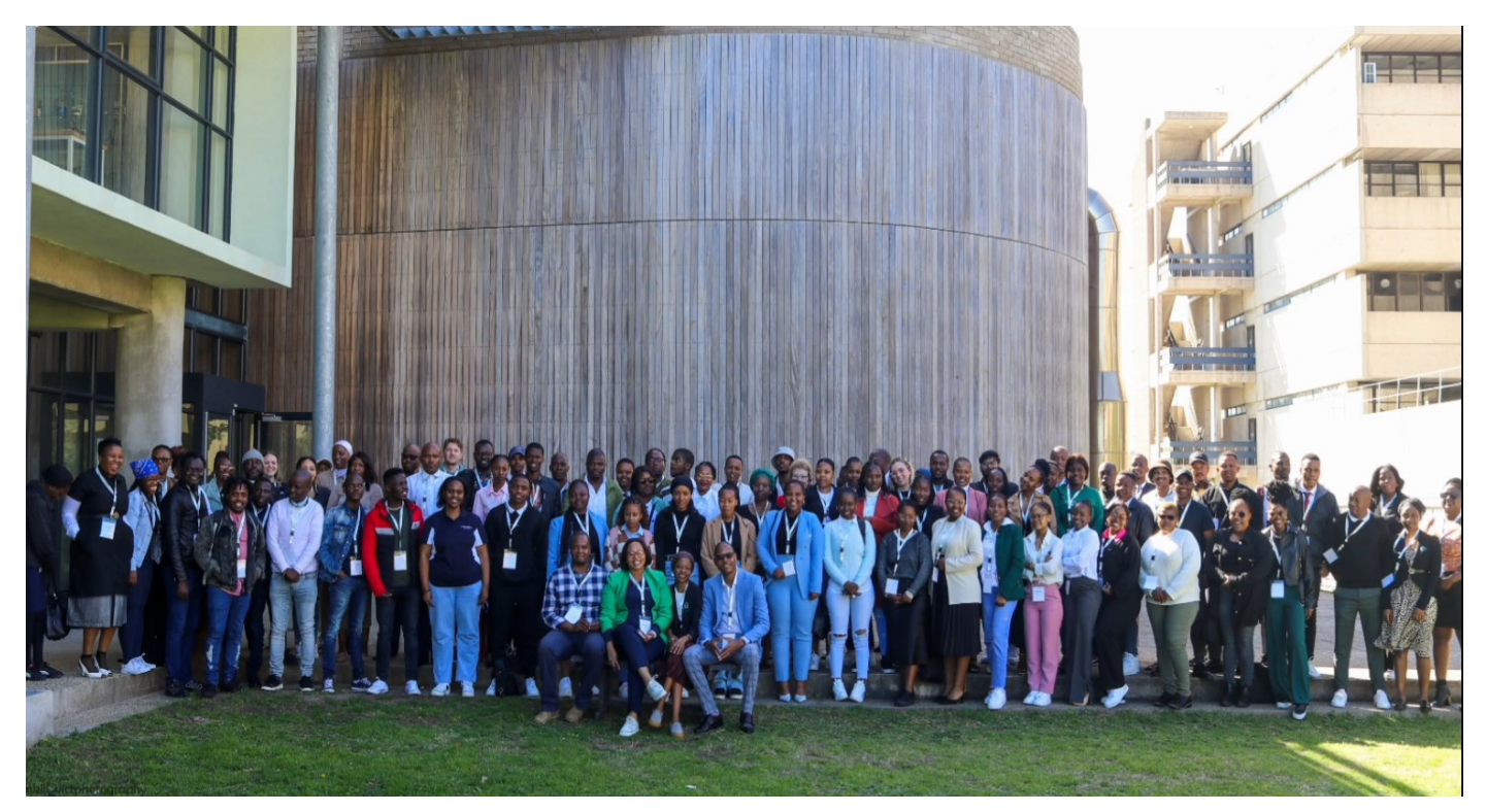
Nanoscience Young Researchers Symposium Attendees