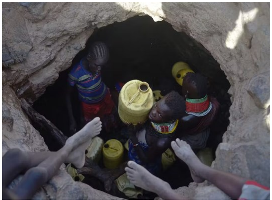
Groundwater is vital to communities in northern Kenya during droughts.

The monitoring network on our continent is unfortunately limited or non-existent in certain countries. In some, like South Africa, the network is slowly diminishing. This is unfortunate as the ability to measure allows better management of groundwater resources.